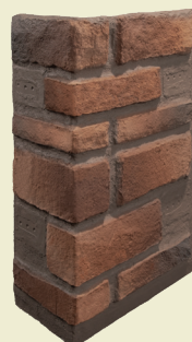
Integrated Outside Corner