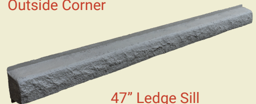
47" Ledge Sill