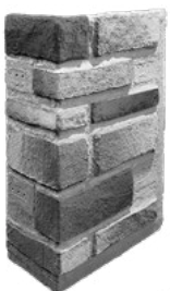
Ashlar Stone Integrated Outside Corner